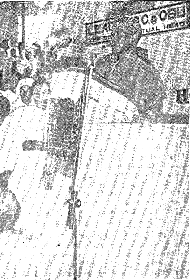
...sis of the reign of God", to the congregation

God. The people of that area dread Brotherhood. Once you go there as a member of Brotherhood, they hold you in awe. The entire place is rendered spiritually weak.